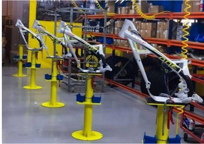
Images from the first day of production of the RR model, mid-December 2016